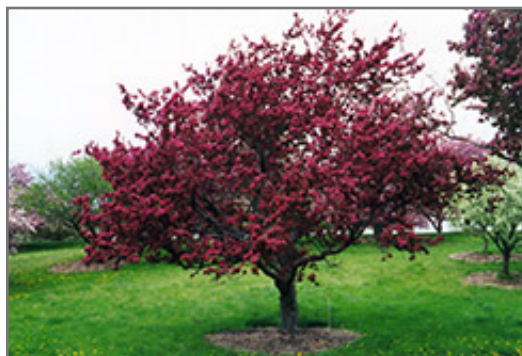
Profusion Flowering Crab in bloom