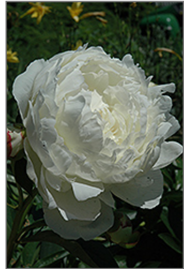
Elsa Sass Peony flowers