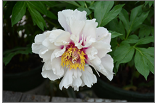
Cora Louise Peony flowers