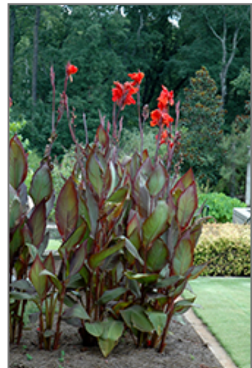
Australia Canna in bloom