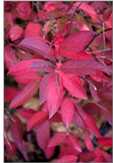
Henry's Garnet Virginia Sweetspire in fall

This plant is not reliably hardy in our region, and certain restrictions may apply; contact the store for more information.