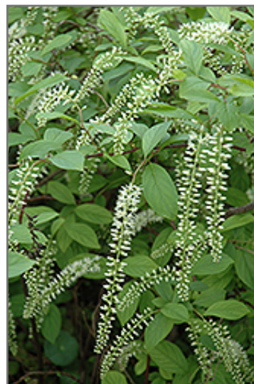
Henry's Garnet Virginia Sweetspire flowers

Henry's Garnet Virginia Sweetspire is recommended for the following landscape applications;