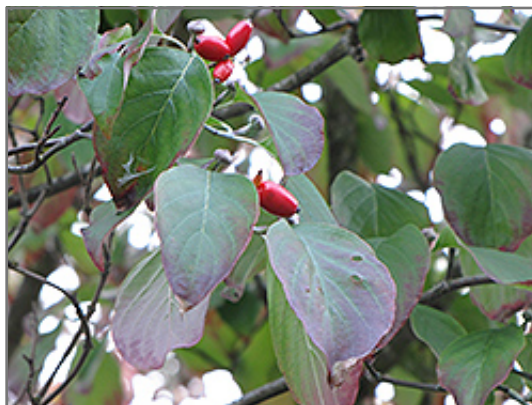
Cherokee Chief Flowering Dogwood fruit

* This is a 'special order' plant - contact store for details