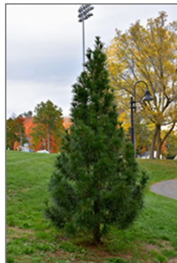
Wintergreen Umbrella Pine