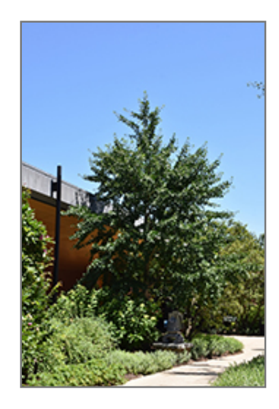
Autumn Gold Ginkgo