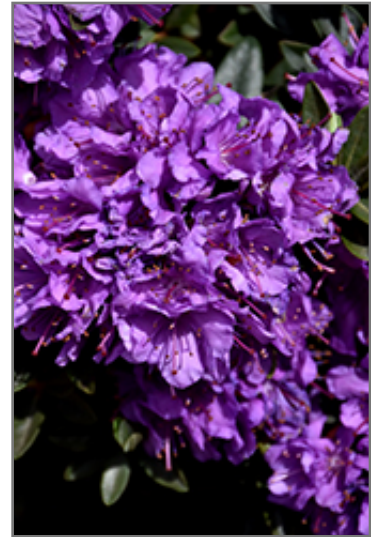
Purple Gem Rhododendron flowers