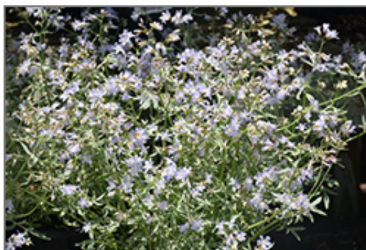
Touch Of Class Jacob's Ladder flowers