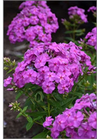
Flame Lilac Garden Phlox flowers

Flame Lilac Garden Phlox is recommended for the following landscape applications;