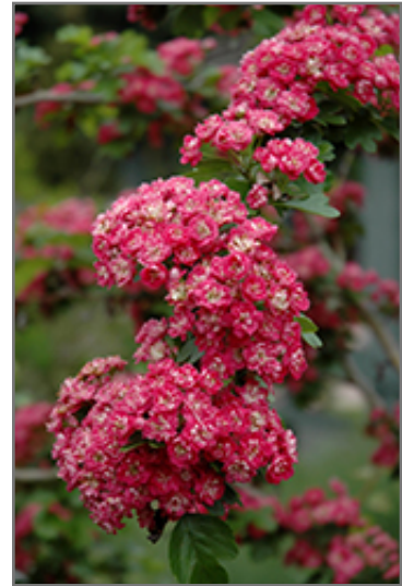
Toba Hawthorn flowers

Toba Hawthorn is recommended for the following landscape applications;