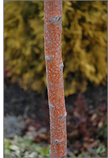
Toba Hawthorn bark

* This is a 'special order' plant - contact store for details