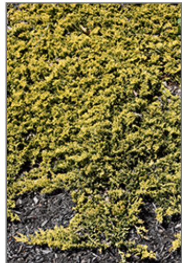
Mother Lode Juniper foliage