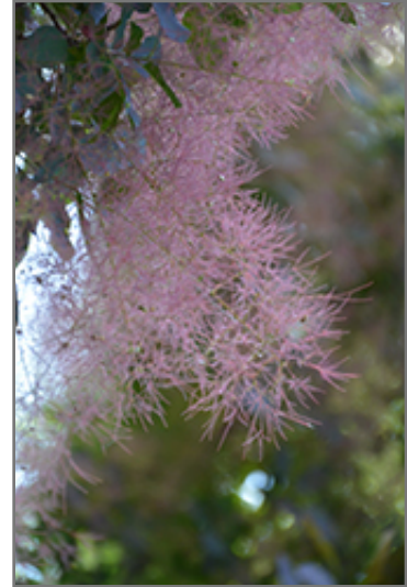
Royal Purple Smokebush flowers

This plant is not reliably hardy in our region, and certain restrictions may apply; contact the store for more information.