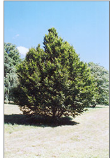
American Hornbeam

The American Hornbeam is recommended for the following landscape applications;