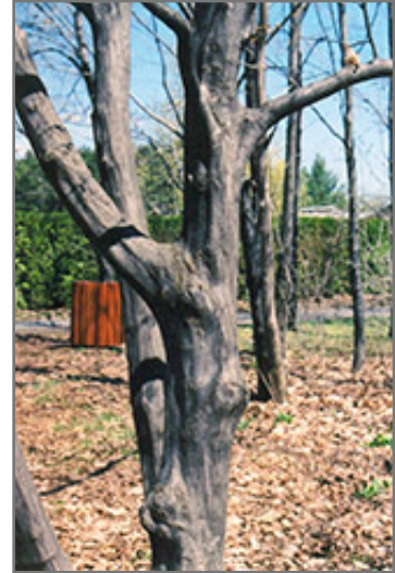
American Hornbeam bark

* This is a 'special order' plant - contact store for details