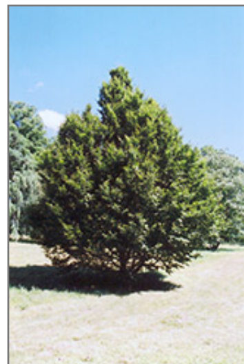
American Hornbeam

The American Hornbeam is recommended for the following landscape applications;