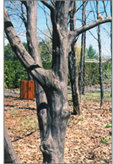
American Hornbeam bark

* This is a 'special order' plant - contact store for details