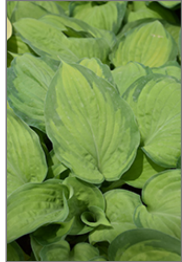
Paradigm Hosta foliage

Paradigm Hosta will grow to be about 10 inches tall at maturity extending to 18 inches tall with the flowers, with a spread of 4 feet. When grown in masses or used as a bedding plant, individual plants should be spaced approximately 4 feet apart. Its foliage tends to remain low and dense right to the ground. It grows at a medium rate, and under ideal conditions can be expected to live for approximately 10 years. As an herbaceous perennial, this plant will usually die back to the crown each winter, and will regrow from the base each spring. Be careful not to disturb the crown in late winter when it may not be readily seen!