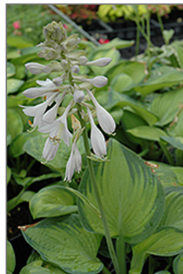
Paradigm Hosta flowers