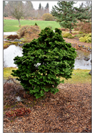
Dwarf Hinoki Falsecypress