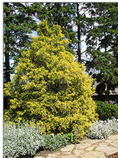
Golden Threadleaf Falsecypress

Golden Threadleaf Falsecypress is recommended for the following landscape applications;