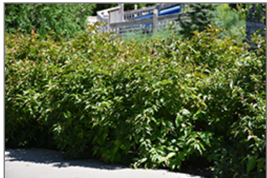
Copper Bush Honeysuckle