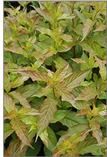
Copper Bush Honeysuckle foliage