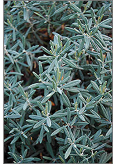
Blue Ice Bog Rosemary foliage

This shrub does best in full sun to partial shade. It prefers to grow in moist to wet soil, and will even tolerate some standing water. It is not particular as to soil type, but has a definite preference for acidic soils, and is subject to chlorosis (yellowing) of the foliage in alkaline soils. It is somewhat tolerant of urban pollution, and will benefit from being planted in a relatively sheltered location. Consider applying a thick mulch around the root zone in winter to protect it in exposed locations or colder microclimates. This is a selection of a native North American species.