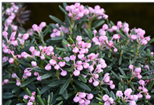
Blue Ice Bog Rosemary flowers