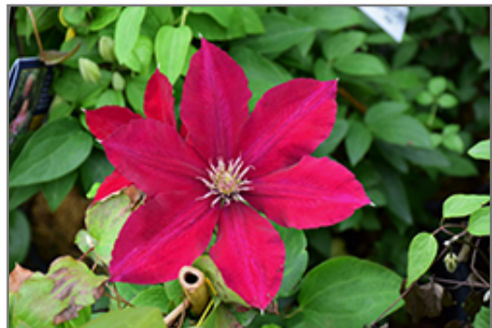
Rebecca Clematis flowers