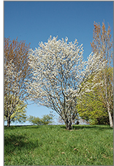
Princess Diana Serviceberry in bloom