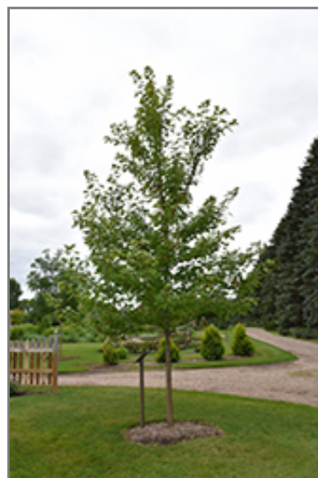
Matador Maple