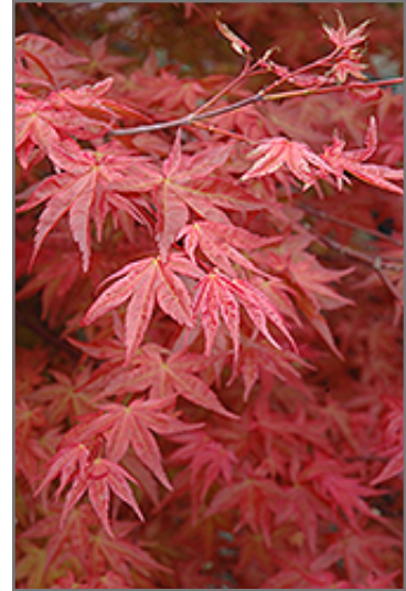
Suminagashi Japanese Maple foliage

This tree does best in full sun to partial shade. You may want to keep it away from hot, dry locations that receive direct afternoon sun or which get reflected sunlight, such as against the south side of a white wall. It prefers to grow in average to moist conditions, and shouldn't be allowed to dry out. It is not particular as to soil pH, but grows best in rich soils. It is somewhat tolerant of urban pollution, and will benefit from being planted in a relatively sheltered location. Consider applying a thick mulch around the root zone in winter to protect it in exposed locations or colder microclimates. This is a selected variety of a species not originally from North America.