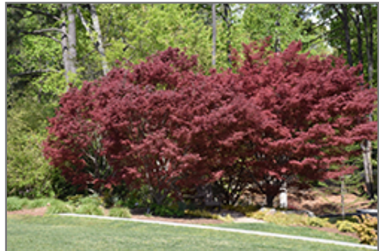
Suminagashi Japanese Maple