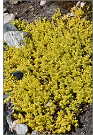
Goldilocks Creeping Jenny

Goldilocks Creeping Jenny will grow to be only 6 inches tall at maturity, with a spread of 3 feet. When grown in masses or used as a bedding plant, individual plants should be spaced approximately 24 inches apart. Its foliage tends to remain low and dense right to the ground. It grows at a fast rate, and under ideal conditions can be expected to live for approximately 10 years. As an herbaceous perennial, this plant will usually die back to the crown each winter, and will regrow from the base each spring. Be careful not to disturb the crown in late winter when it may not be readily seen!