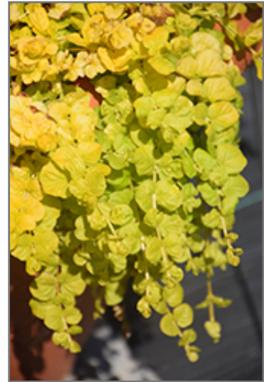
Goldilocks Creeping Jenny foliage