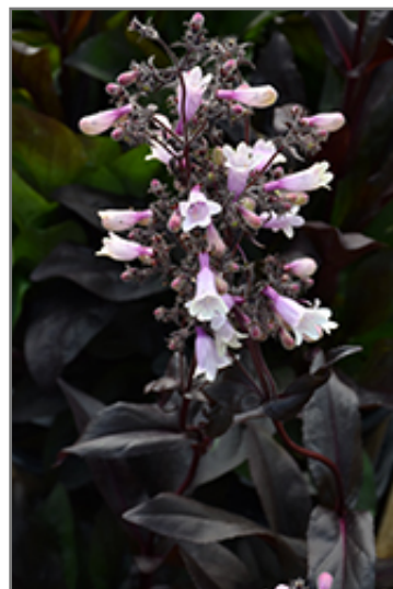
Dark Towers Beard Tongue flowers