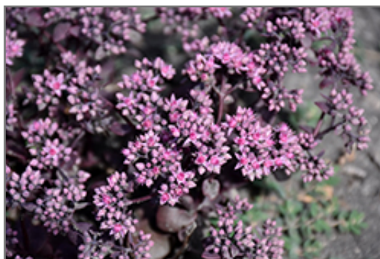
Red Carpet Stonecrop flowers