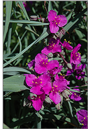
Red Cloud Spiderwort flowers