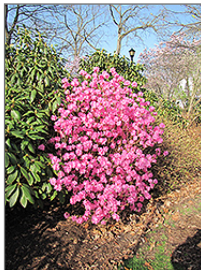
Landmark Rhododendron in bloom