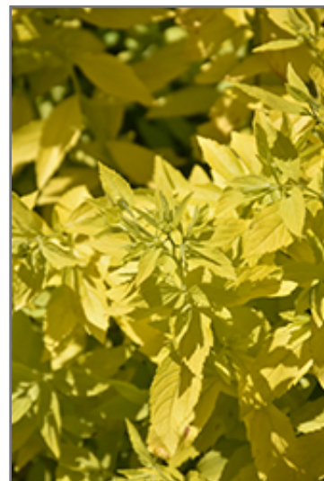
White Gold Spiraea foliage