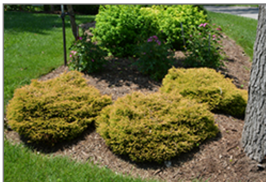
Golden Tuffet Arborvitae