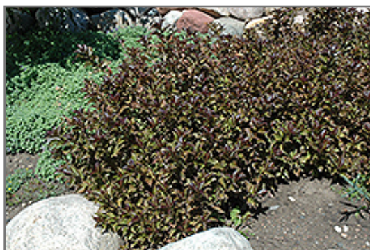
Dark Horse Weigela