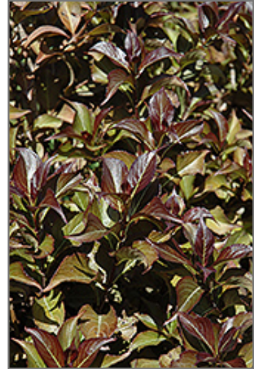
Dark Horse Weigela foliage

* This is a 'special order' plant - contact store for details