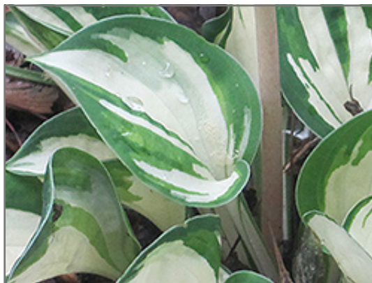
Pandora's Box Hosta foliage