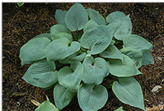
Bressingham Blue Hosta

Bressingham Blue Hosta is recommended for the following landscape applications;