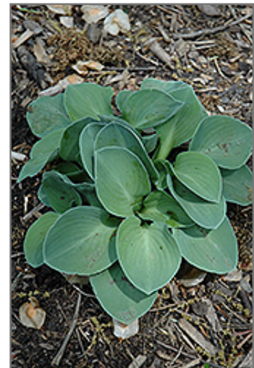
Blue Mouse Ears Hosta