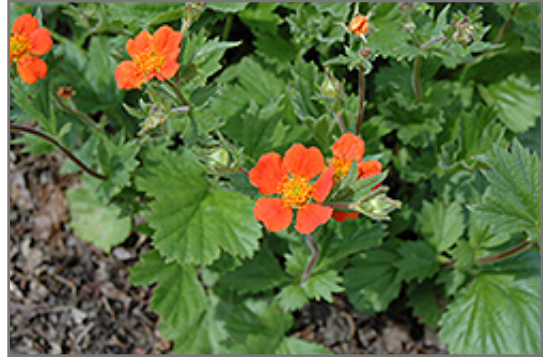
Boris Avens flowers

Boris Avens is recommended for the following landscape applications;