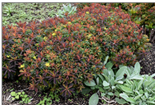
Bonfire Cushion Spurge