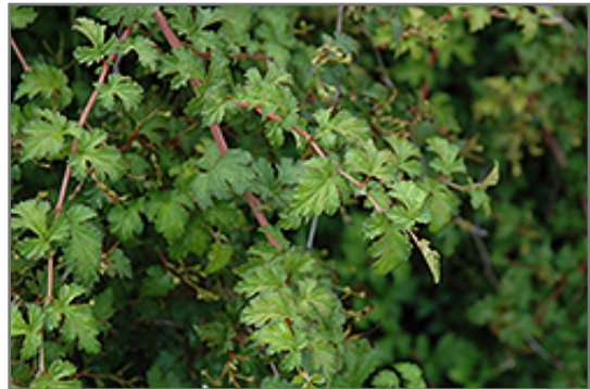
Cutleaf Stephanandra foliage