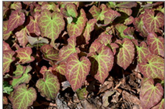
Froehnleiten Bishop's Hat foliage