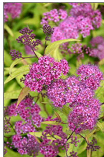
Flaming Mound Spirea flowers

Flaming Mound Spirea is recommended for the following landscape applications;