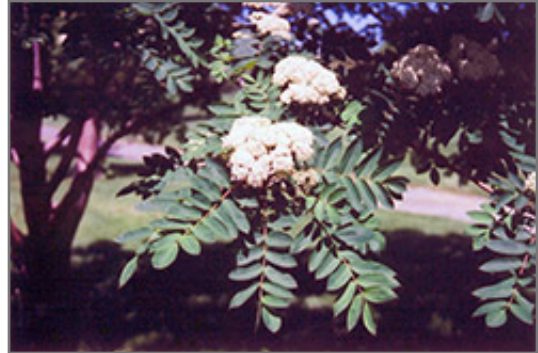
Showy Mountain Ash flowers

This tree should only be grown in full sunlight. It is very adaptable to both dry and moist locations, and should do just fine under average home landscape conditions. It is not particular as to soil type or pH. It is highly tolerant of urban pollution and will even thrive in inner city environments. This species is native to parts of North America.