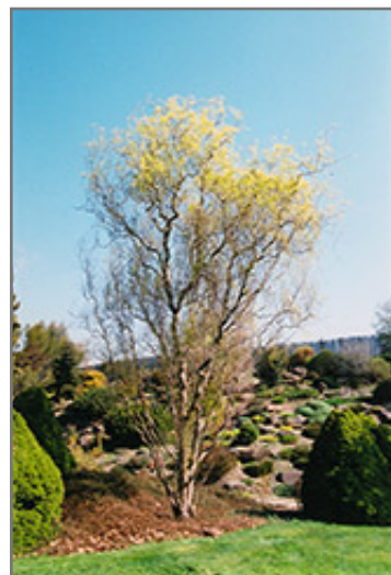
Dragon's Claw Willow in winter