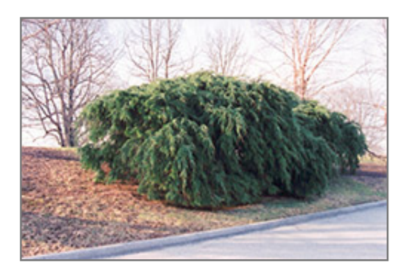
Sargent's Weeping Hemlock

Sargent's Weeping Hemlock is recommended for the following landscape applications;