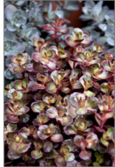
Voodoo Stonecrop foliage

Voodoo Stonecrop is recommended for the following landscape applications;