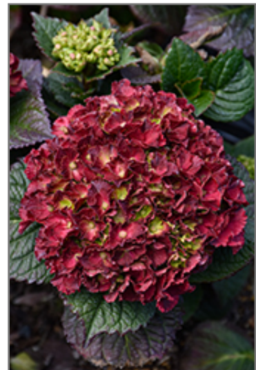
Cherry-Go-Round Hydrangea flowers