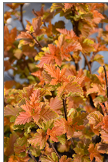
Savannah Sunset Ninebark foliage