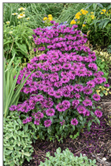
Electric Neon Purple Beebalm in bloom