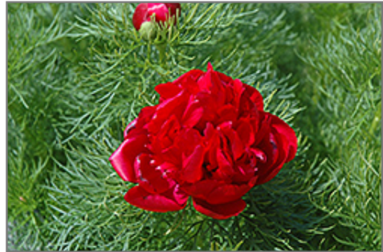
Double Fernleaf Peony flowers