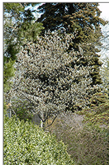
Allegheny Serviceberry in bloom