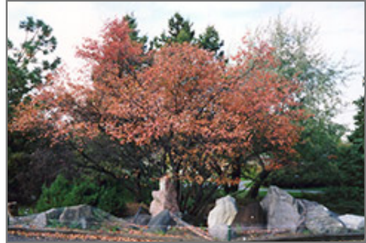
Allegheny Serviceberry in fall

This tree does best in full sun to partial shade. It prefers to grow in average to moist conditions, and shouldn't be allowed to dry out. It is not particular as to soil type or pH. It is somewhat tolerant of urban pollution. This species is native to parts of North America.