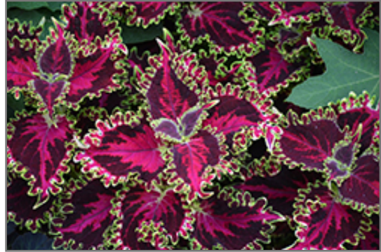
Volcanica Solar Flare Coleus foliage

Volcanica Solar Flare Coleus is recommended for the following landscape applications;