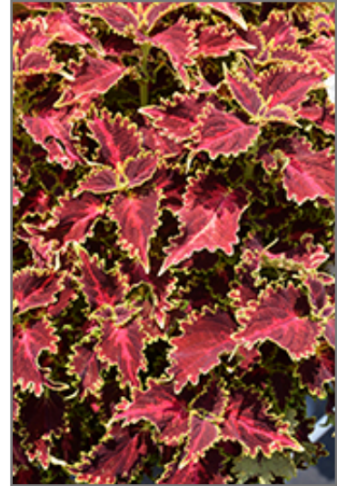
Volcanica Solar Flare Coleus foliage

Volcanica Solar Flare Coleus is a fine choice for the garden, but it is also a good selection for planting in outdoor containers and hanging baskets. It can be used either as 'filler' or as a 'thriller' in the 'spiller-thriller-filler' container combination, depending on the height and form of the other plants used in the container planting. It is even sizeable enough that it can be grown alone in a suitable container. Note that when growing plants in outdoor containers and baskets, they may require more frequent waterings than they would in the yard or garden.